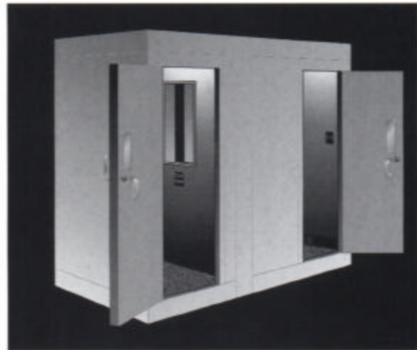
40act Series Audiometric Booth

The 40act Series Single-wall Control/Exam Suite is constructed of 4 in. thick modular panels, complete with carpeted vibration isolated floor, space-saver roof mounted ventilation, recessed electrical, Noise-Lock doors and double glazed windows, audiometric jack panels acoustically matched and shipped ready for field assembly.